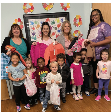
Women United hosted a coat drive earlier this month for two United Way agency partners, Special Learning Center and Little Explorers Discovery Center, to make sure children have the winter attire they need to stay warm and healthy. Each agency was given 17 coats and 4 hat and glove sets.

United Way of Central Missouri's Women United committee hosted its seventh annual—and successful—Power of the Purse fundraiser in November at a new venue this year, Capital Bluffs Event Center. This event brought together nearly 300 community-minded women who are passionate...not only about purses, but about the bigger message beyond the gorgeous Gucci, Coach and Chanel handbags...joining in the fight for the health, education, financial stability and basic needs of every person in our community. Thanks to the generosity of community supporters, the event offered over one hundred purses for the silent and live auction, mystery jewelry boxes, permanent jewelry linking and a variety of quality wine selections in the wine pull. Purses ranged from vintage collectibles to brand name favorites, and thirteen selective purses were elevated from silent auction to live auction status. It was a perfect evening that concluded with local celebrity gentlemen modeling the live auction purses that had unique experiences tucked inside...experiences such as a 3-hour limousine ride for 8-10 passengers, a