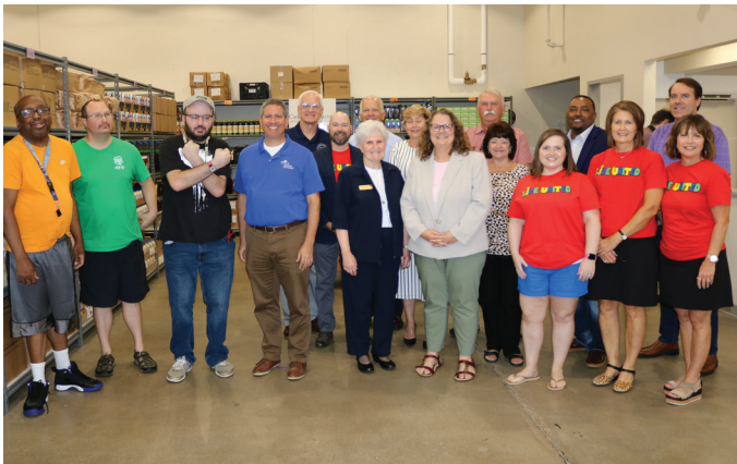
UCP Heartland was thrilled to be included as one of three new member agencies announced at a United Way of Central Missouri press conference held last summer.

UCP Heartland being invited to join the United Way of Central Missouri network reflects a strategic move to amplify our impact. By becoming a member agency, UCP Heartland gains access to a broader network of resources, support and collaborative opportunities. This partnership not only facilitates increased outreach but also opens doors to potential grants that can further fuel the organization's initiatives.