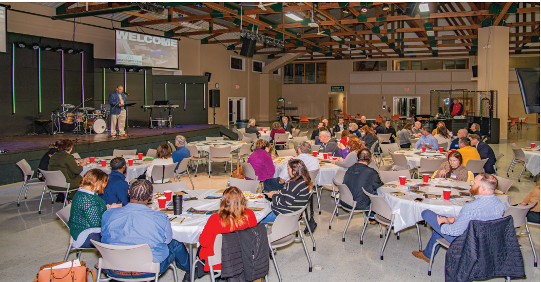
The recently formed Community Organizations Active in Disaster (COAD) hosted its first community meeting in mid-November. The next meeting will take place February 27 at 5:30 pm, and those interested in attending can register at www.unitedwaycemo.org/disaster .