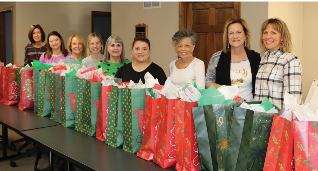
Women United filled Christmas bags with personal care items to gift to 45 individuals in need this holiday season.

like ours, we take care of each other! Power of the Purse is one example of the type of events and networking opportunities that is available through United Way of Central Missouri's affinity group: Women United. Women United is an opportunity for women of all ages, backgrounds and skills sets to come together to help children, families and seniors in need through volunteering, advocating and special-event fundraising. Just over the last month, this incredible group of ladies hosted Power of the Purse, ran two coat drives to support Special Learning Center and Little Explorers Discovery Center and also gifted Christmas presents filled with personal care items to 45 individuals in need. If you are interested in being a part of this dynamic, philanthropic group please visit www.unitedwaycemo.org/womenunit to learn more and sign up.