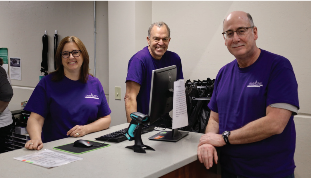
Pictured above: Staff and volunteers prepare for a shift at the Catholic Charities Food Pantry where they will help neighbors shop, check out groceries and load their car.