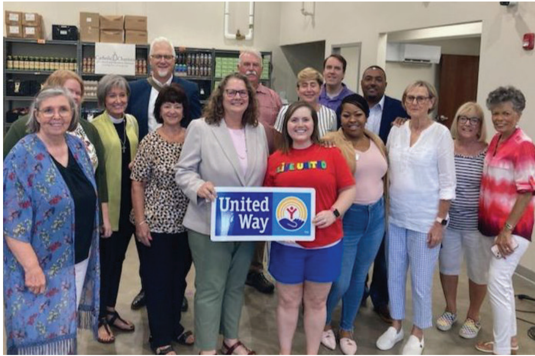
Staff, volunteers and supporters of Common Ground Community Building celebrate becoming a United Way of Central Missouri partner agency at a press conference held this summer.